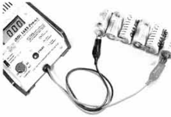
CONNECT TO A 4-7 CELL PACK (sub-c size only)