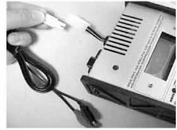
12V DC CORD INPUT CONNECTION