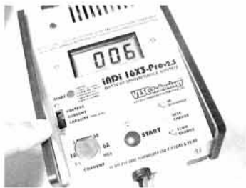
THE SIDE SELECTOR CONTROLS THE LCD