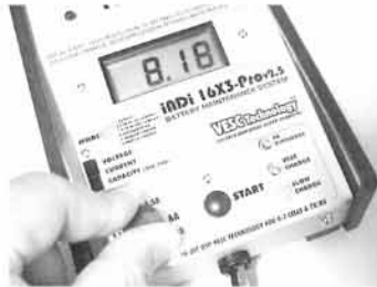
ADJUST THE KNOB TO PROPER AMP SETTING