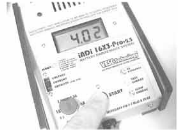
PRESS START TO FAST CHARGE (REPEAK)