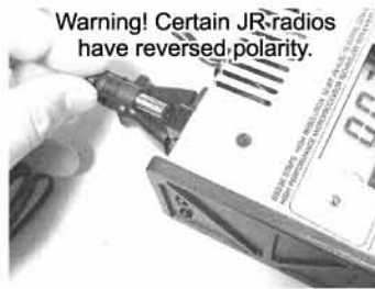
THIS PLUG IS FOR TX/RX SLOW CHARGE

The side selector-control switches the LCD display between VOLTAGE, CURRENT & RUNTIME. When user become more familiar with your new charger and battery packs, you can tell if you battery is fully charged by looking at the fast charge voltage and tickle charge voltage. The run-time display gives you estimated vehicle run time in second while charging and discharging. For example, during charging 050 means the charger have recharged approximately 50 seconds of runtime back into your battery pack. Never set charging current higher than battery mfg suggested fast charging current and always observe pack temperature to avoid overcharging.